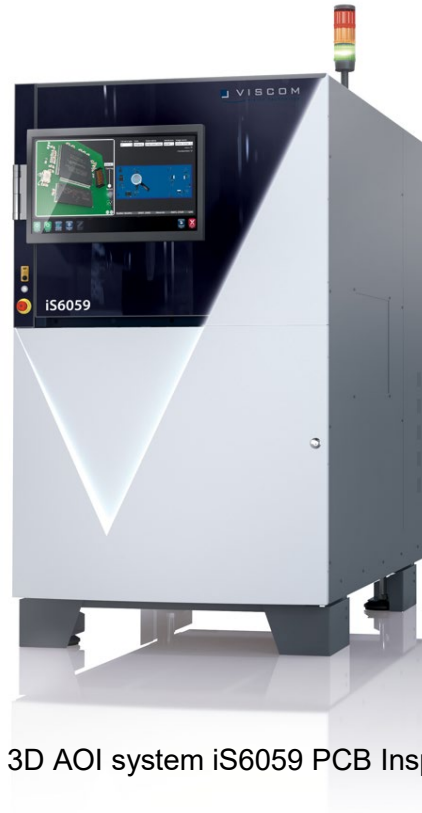
New Viscom 3D AOI system iS6059 PCB Inspection Plus